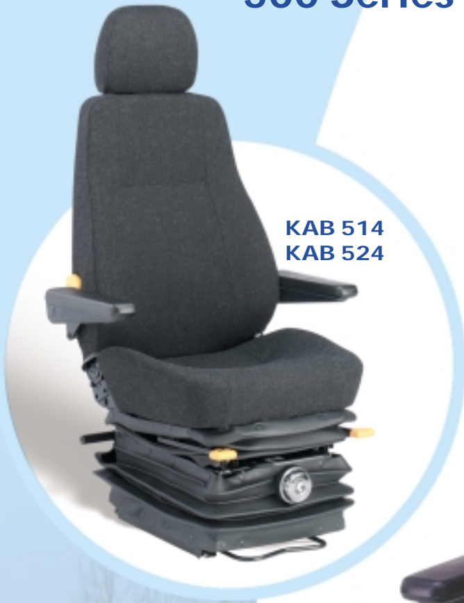
KAB 514 KAB 524