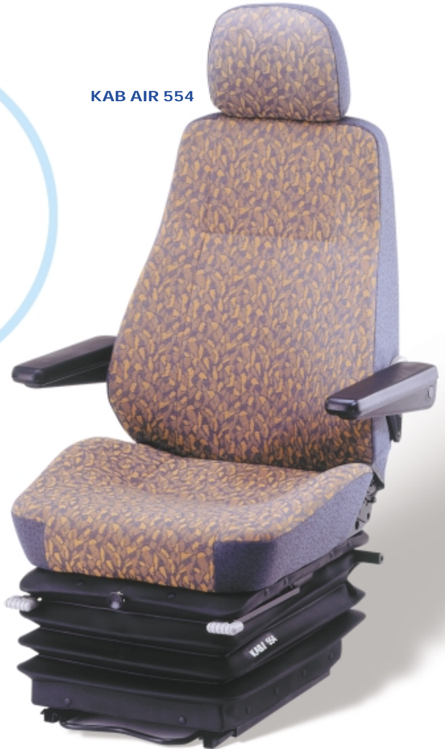
KAB AIR 554